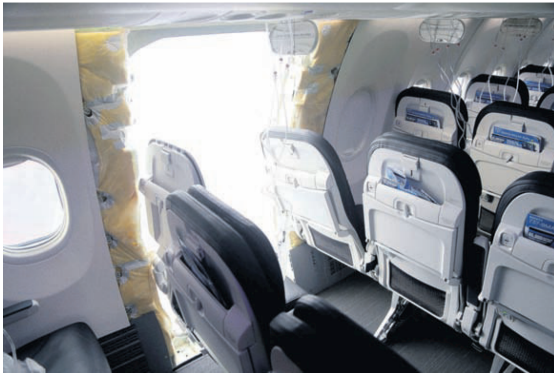
This photo released by the National Transportation Safety Board shows a gaping hole where the paneled-over door had been at the fuselage plug area of Alaska Airlines Flight 1282, Jan. 7, 2024, in Portland, Ore.

The Journal reported that the investigation would